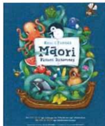
Kat Quinn & Pania Papa

He papakupu whakaahua mā te whānau katoa A maori language picture dictionary for the whole whānau