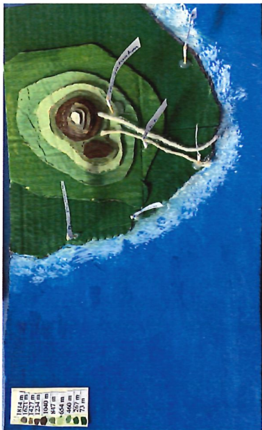
3D Topographical map

As part of their Keep Aotearoa/New Zealand Beautiful inquiry focusing on Kaitiakitanga (with a specific focus on waste management), Room 19 has been participating in the Nestlé for Healthier Kids Sea Cleaners school programme. Through this programme, we have been learning about topographical maps and determining the path a piece of rubbish may take to reach the Pacific Ocean. This path includes rivers, streams and the storm water network.