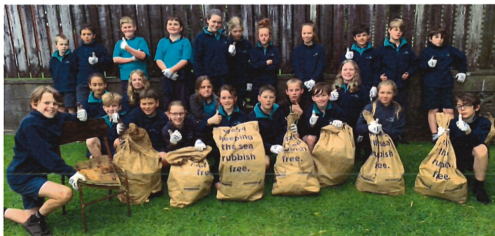
Room 19 at the William Corbett Reserve entrance.

Room 19 organising the rubbish into a bar graph (glass, non-recyclable, recyclable, cans, other)